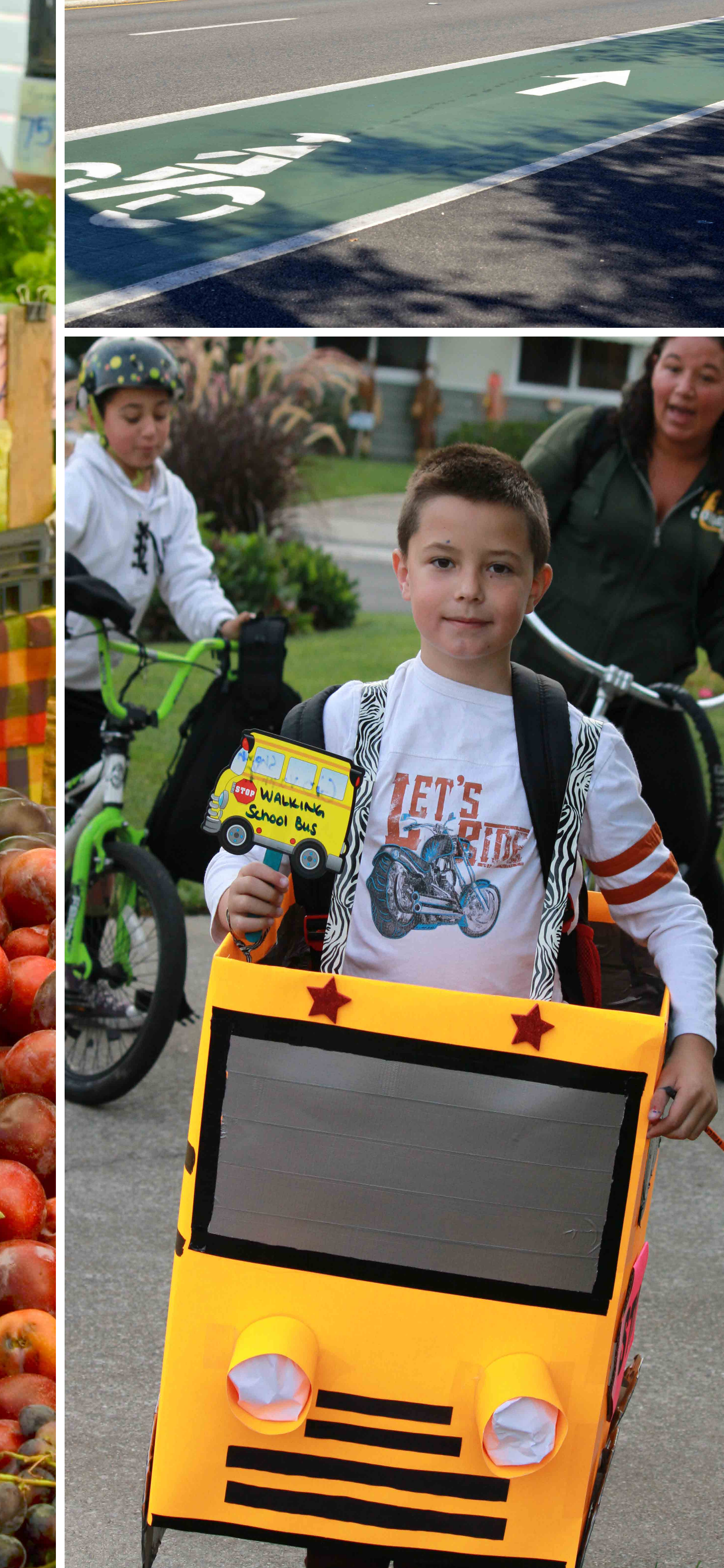
Among the policies included in the Health Element, many focus on promoting equitable access to healthy foods, physical activity, and safe

access the adopted Health Element, scan the QR code at the bottom of this page or visit http://bit.ly/1L1KWZK.